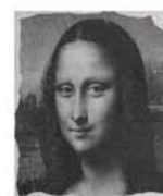
Old World Art